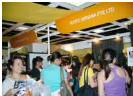
^ Singapore pavilion exhibitor, Rustic Nirvana's booth was crowded with visitors daily at the Fair.

According to a survey done by the organiser ECMI Services Sdn Bhd, the 4-day exhibition attracted more than 13,000 trade visitors from 27 countries.