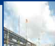
BEFORE Wind socks located at high-level areas that required crane and man-cage to change