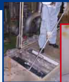
BEFORE Scooping floss manually

Despite having cost $5,200 to install the weir, their project created a low-risk hazard workplace without anyone falling into the hot water and further improve productivity as now operators need only once a week to clear the floss from collected mesh.