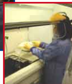
AFTER Protection by PPE and Engineering control