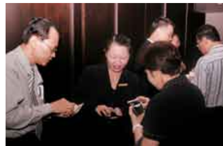
^ Members networking well