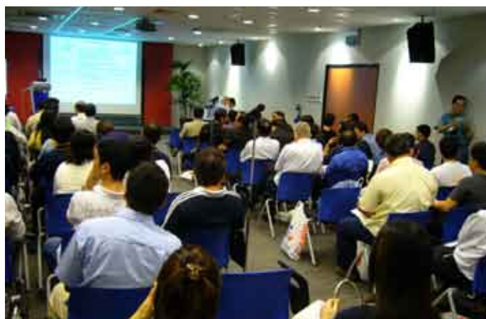
^ Excellent turnout during the award ceremony

and even the judges were left amused yet encouraged by the enthusiasm from the participants.