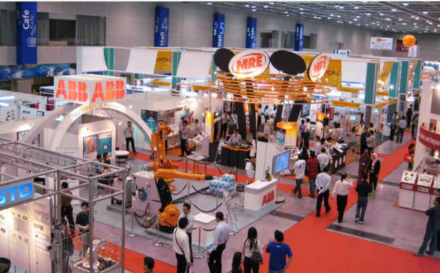
^ The bird eye view of the Industrial Automation on the first day morning of the launched.

Industrial Automation and Asean Elenex were held across four days from 18 to 21 July 2007 at Kuala Lumpur Convention Centre, Malaysia which attracted 600 companies from over 40 countries across the region. Exhibitors from India, Singapore, South Korea, Spain, Turkey and United Kingdom were present to showcase the state-of-the-art technologies and solutions from the automation industry.