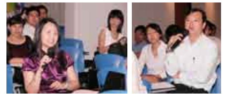
^ Active participation during Q & A Session

With these initiatives, it is desirable that companies are able to adopt the best practices throughout their operations to remain competitive in the local and global market.