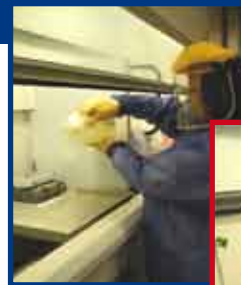
BEFORE Protection by PPE usage

Now with the convenience of the adaptability of the beaker holder, each compartment can hold any form or height of the apparatus by changing the holder plate or hold beakers with new designs by fabricating the plate. The working area becomes tidier and more organised, and this helps to free up additional working space.