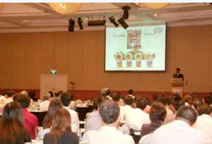
^ The Food Conference in action