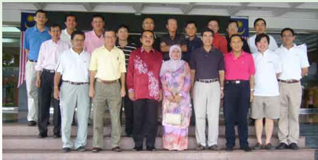
^ Members from FMM and SMA with the Governor of Malacca

A friendly golf tournament between the Federation of Malaysian Manufacturers (FMM) and SMA was held on 18 and 19 August 2007 at Tiara Melaka golf course and Orna Golf and Country Club, Malacca.