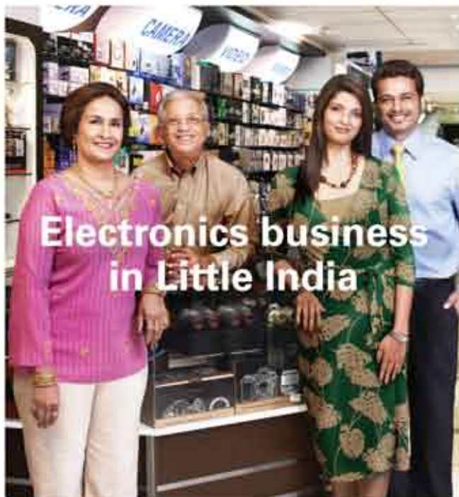
Electronics business in Little India