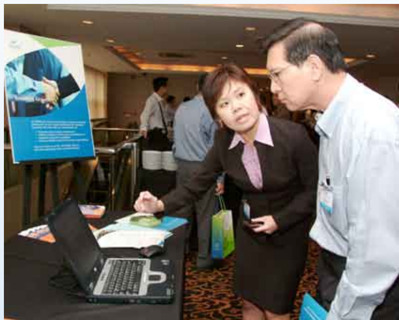
^ A staff from SPRING Singapore explaining to a participants of the usefulness of the FIRS database portal