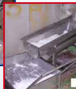
AFTER Floss purge out and filtered with mesh