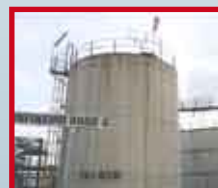
AFTER Re-located, now risk and hassle-free