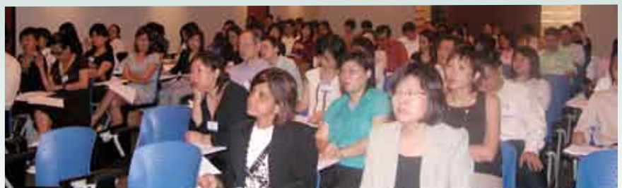
^ Excellent turnout at the seminar

With the government's launch of the Budget 2007 early this year, SMA and the Inland Revenue Authority of Singapore (IRAS) jointly organised a seminar to update members on their tax obligations, the completion of the Company's Income Tax Return (Form C) and tax provisions.