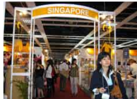
^ Design of Singapore pavilion at CosmoBeaute Asia 2007

Approximately RM$7 million worth of business deals were concluded during the entire exhibition period.