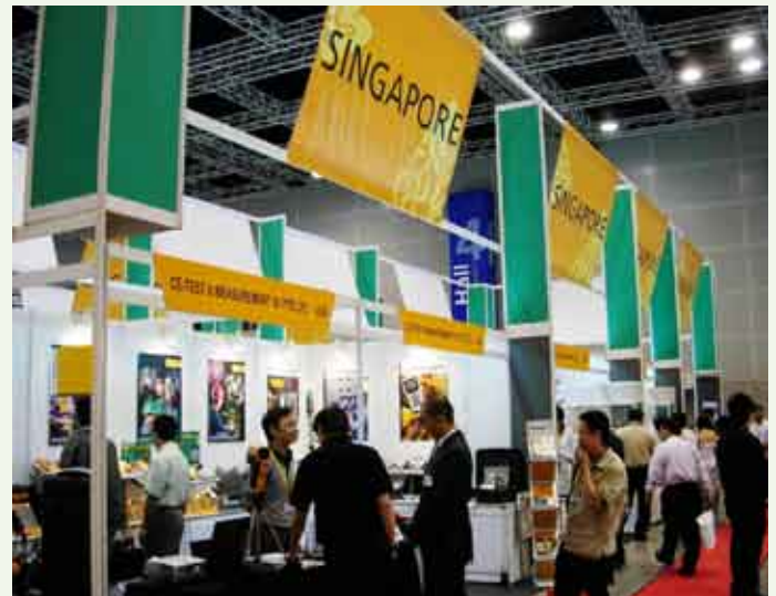
^ Singapore Pavilion was packed with visitors

The 4th series of the biennial industrial Automation 2007 (IA 2007) exhibition and conference and the 7th Asean Elenex 2007 cordially invited the honourable Minister of Energy, Water & Communications, Malaysia YB Dato' Sri Dr Lim Keng Yaik to launch its official opening.