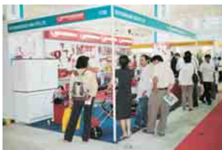
^ Visitors at the Singapore Pavilion