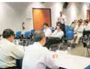
<< The Q&A session in action