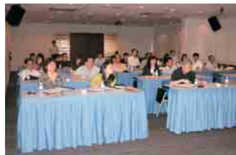
^ A group of attentive participants

A seminar on access to the Chinese market was organised on Thursday, 29 March 2007. It was a resounding success for Singapore Manufacturers' Federation (Sma) Automation Technology Industry Group (ATIG) together with Underwriter Laboratories International Limited (UL).