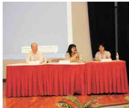
^ Officials from AVA and HPB during the Q&A session