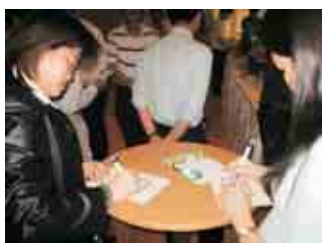
>> Participants writing their WSH2015 pledge stickers

In support of the Workplace Safety and Health 2015 (WSH 2015) campaign, organised by the Workplace Safety and Health Advisory Committee and in collaboration with the Ministry of Manpower (MOM), SMA recently held a seminar on 3 May 2007. It covered topics on safety in workplace to promote higher safety standards for higher performance at the workplace.