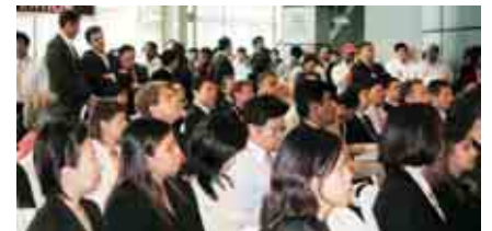
^ Participants at the Cards Asia 2007