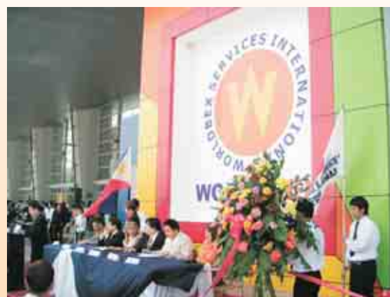
^ The Opening Ceremony of WORLDBEX 2007