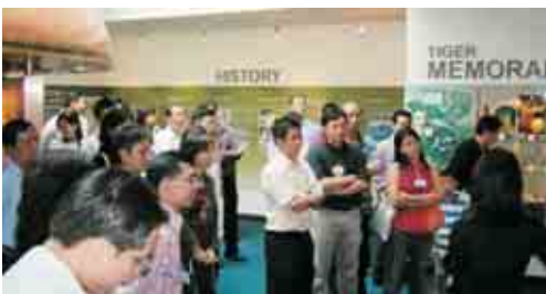
^ Members listening to the Tour Ambassador

On 15 March 2007, a tour to Tiger Beer brewery was organised by Sma for members. Participants discovered the processes of producing one of the finest beers in the world.