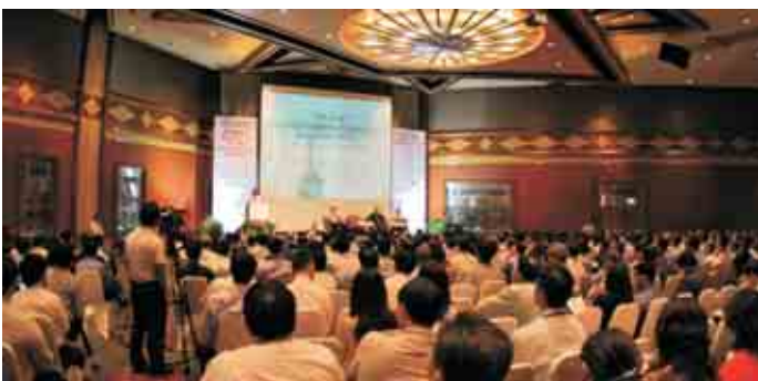
^ Overwhelming participation at the dialogue session

The 600 participants from the business community had the privilege of several Singapore Ministers to provide insights to government plans and intentions. Prof. S. Jayakumar, Deputy Prime Minister and Coordinating Minister for National Security and Minister for Law, Associate Prof. Ho Peng Kee, Senior Minister of State for Law and Home Affairs, and Mr. S. Iswaran, Minister of State for Trade and Industry were present.