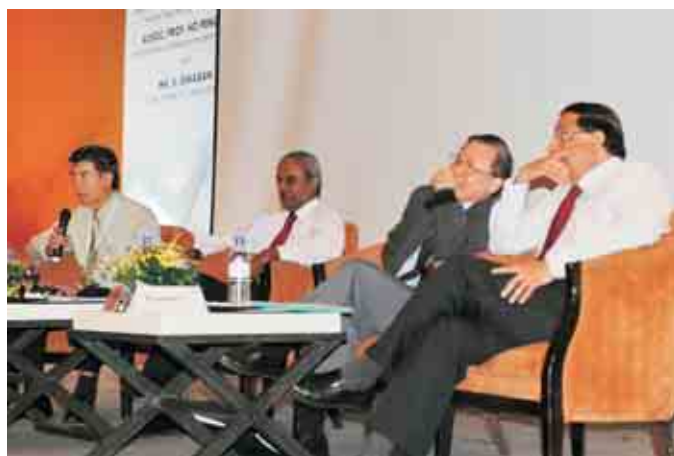
^ SMA President with the panel of Singapore Ministers

The 600 participants from the business community had the privilege of several Singapore Ministers to provide insights to government plans and intentions. Prof. S. Jayakumar, Deputy Prime Minister and Coordinating Minister for National Security and Minister for Law, Associate Prof. Ho Peng Kee, Senior Minister of State for Law and Home Affairs, and Mr. S. Iswaran, Minister of State for Trade and Industry were present.