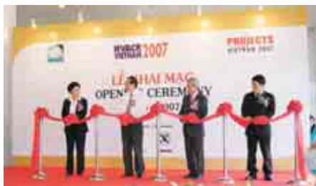
^ The opening ceremony of HVACR