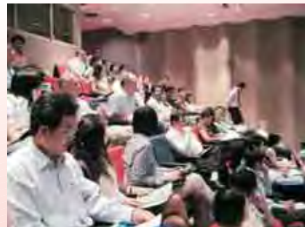
Participants at the GHS seminar.

Several GHS training sessions on "The Chemical Users Course" and "The Classification Course" will be conducted in 2007. Do keep a lookout for more details from SCIC!