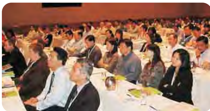
^ Participants at the SCIC Conference 2006

SCIC is currently working with industry members and the respective government agencies to monitor the developments of REACH regulation. For more information, please email to SCIC at secretariat@scic.org.sg .