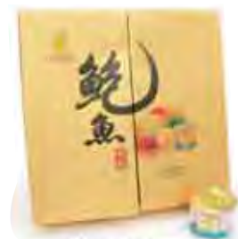
New Moon Abalone Yusheng by Goh Joo Hin Pte Ltd

Well done and congratulations to all our winners!