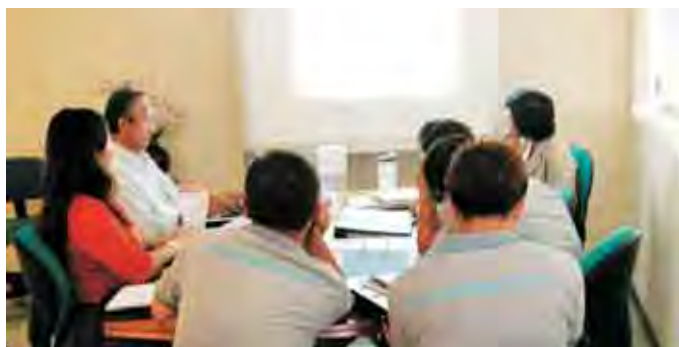
Discussion in progress on the 5S system

Tee Hai Chem Pte Ltd, a leader in the local chemical industry, imports, distributes and manages a wide range of chemicals for the semiconductor and pharmaceutical industries, including ultra-pure chemicals, performance and specialty chemicals. The company owns and manages a 147,000 sq ft warehousing and logistics system and serves many of the leading semiconductor manufacturers in Singapore and the region.