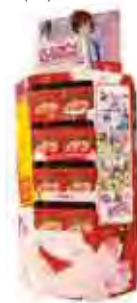
Kitkat Sakura by SCA Packaging Asia Singapore Pte Ltd