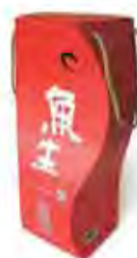
Kwong Cheong Thye Yu Sheng by A.S. Louken Group Pte Ltd