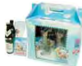
Erdinger Oktoberfest 2006 by Starlite Printer (FE) Pte Ltd