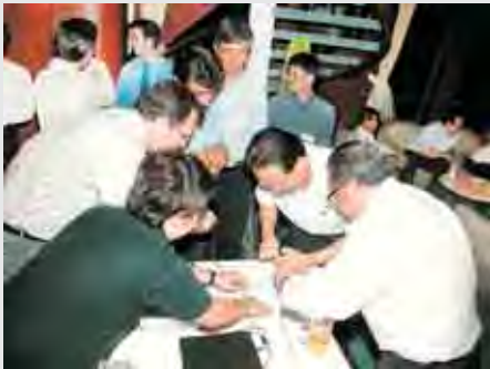
^ Members participating enthusiastically during the games segment

Some 70 members escaped the hustle and bustle of city life to attend a networking session organized by the Singapore Manufacturers' Federation (SMA) on 8 November 2006. Sponsored by Citigroup's Commercial Banking Group, the event was held onboard the MV Harbour Queen, which took participants around the southern part of Singapore waters.