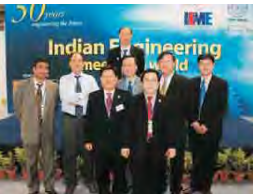
^ Singapore delegates at the India Engineering Meet

The Metal, Machinery & Engineering Industry Group (MME IG) of the Singapore Manufacturers' Federation (SMA), at the invitation from the Engineering Export Promotion Council of India (EEPC), led a trade delegation to New Delhi, India from 21 – 25 January 2007.