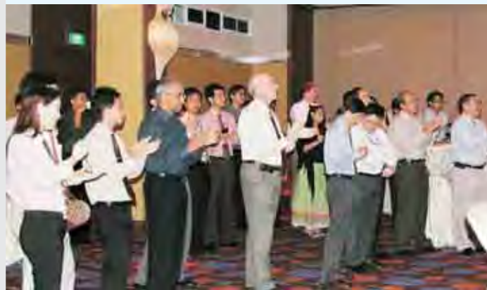
^ Guests at the SCIC Cocktail Reception

Similar to the previous year, the Singapore Chemical Industry Council (SCIC) organized a Year-end Cocktail Reception-cum-Networking Session to thank SCIC members for their tremendous support for the past year. The 2006 reception was held at The Legends, Fort Canning on 20 November 2006.