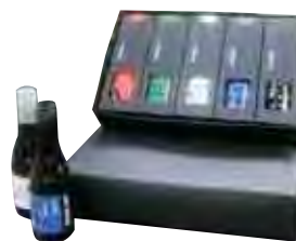
Artwines by Sevenoaks Wines