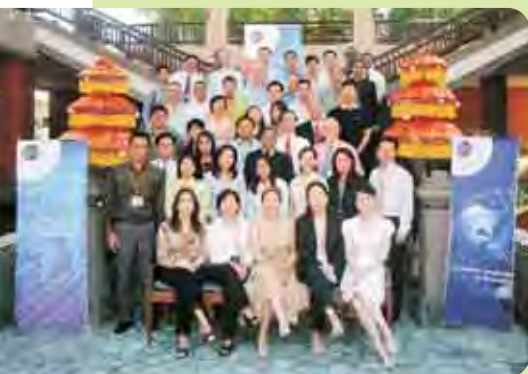
^ Delegates from the 17 GS1 Asia Pacific Member Organisations gathered in Bali for the 2006 GS1 Asia Pacific Regional Forum

The GS1 Head Office (HO) conducts Regional Forums separately in Europe, Latin America, Middle East and the Asia Pacific Regions from September to October each year to gauge member's reactions on the new policies. These new policies will be introduced at the combined GS1 Global Forum in February in the following year in Brussels.