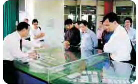
^ A detailed introduction of the Sembcorp Industrial Park was provided to the delegates

Through first-hand encounters with the relevant Batam officials, participating members gained valuable information and insights, which were not readily accessible, to assist them in making a more informed decision on investing in Batam.