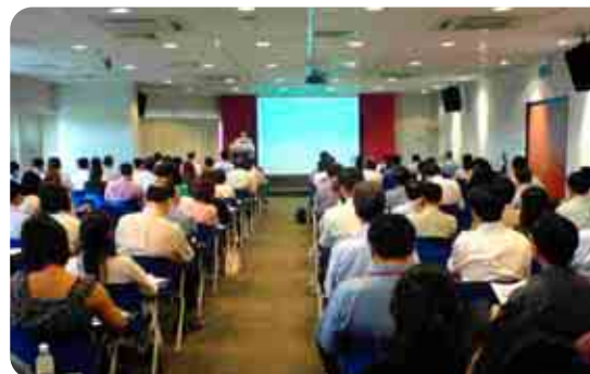
↑ The auditorium packed with 150 participants