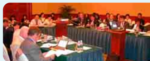
↑ The GS1 Asia Pacific Regional Forum 2005 in progress

On the last day of the forum, field visits were arranged for the delegates to visit NOL Radio Frequency Identification (RFID) Performance Test Lab, PSA Container Port, the new RFID-enabled National Library and Asia Pacific Breweries.