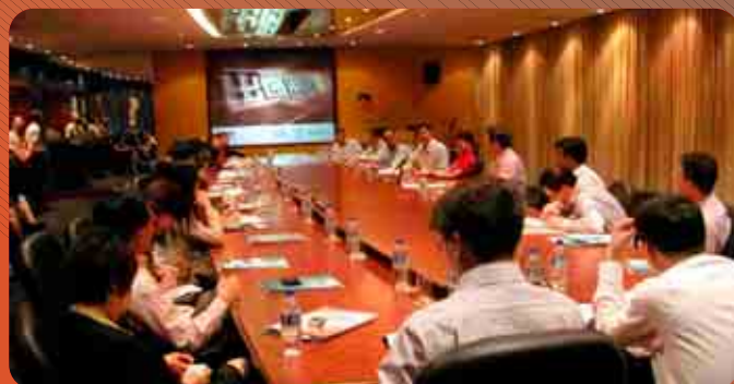
↑ A huge turnout of journalists at the <<出奇制胜 Made-in-Singapore>> media conference on 16 January 2006