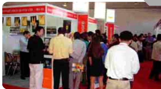
↑ Brisk business at the Singapore Pavilion!

Food & Hotel Vietnam 2005 was organised by the Singapore Exhibition Services Pte Ltd.