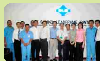
↑ Visit to Sumiko Leadframe Bintan