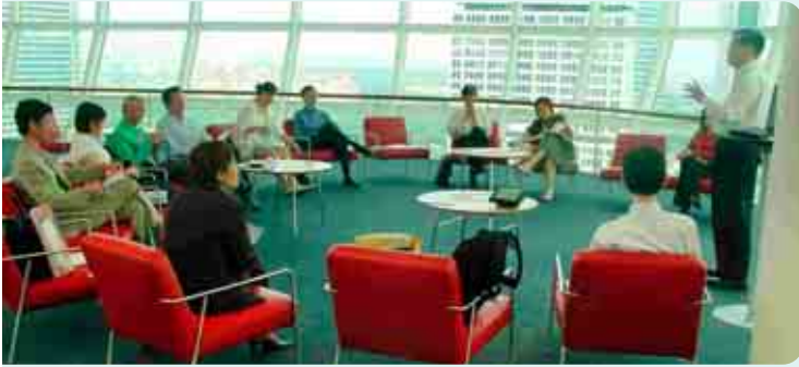
↑ A CoP session in progress

Communities of Practice (CoP) have been around for as long as human beings have learned on a collective or communal basis. At home, at work or at school, we all usually belong to a number of them. Through these informal learning networks, we managed to increase our knowledge and experiences, and ultimately our contributions back to the communities and society.