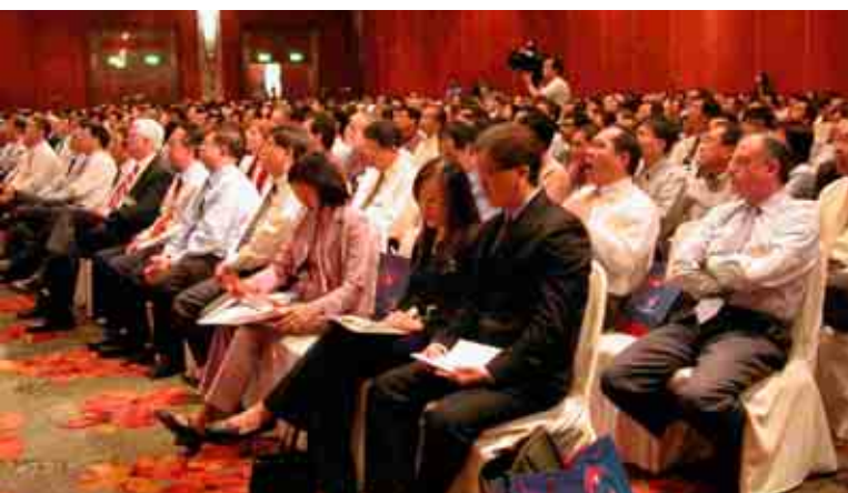
↑ The event saw an overwhelming attendance of more than 800 members and guests