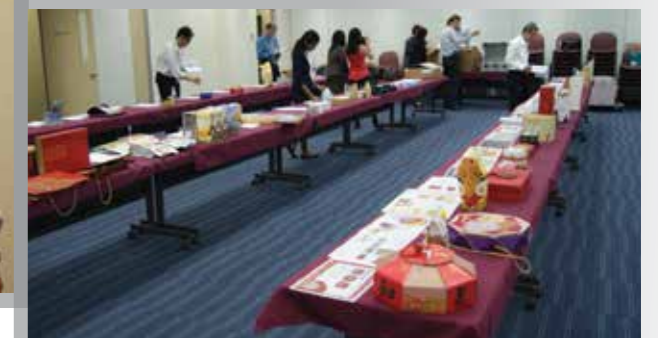
The Singapore Packaging Star Award 2013 attracted entries from manufacturers, designers, and students alike