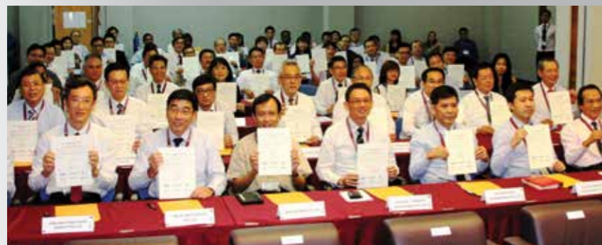
Over 60 companies demonstrated their support of the PeMC Certification in the pledge-signing ceremony

The certification industry framework was developed jointly with the Singapore Precision Engineering and Tooling Association. The initiative was supported by the Singapore Economic Development Board, Nanyang Polytechnic, SPRING Singapore and Singapore Workforce Development Agency. In a show of advocacy for this initiative, more than 60 precision engineering companies signed the pledge at the signing ceremony.