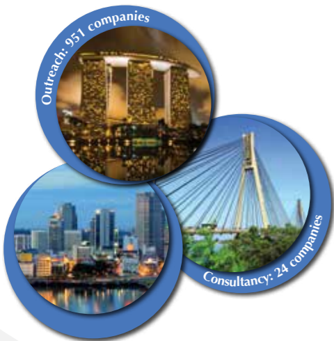
A brief summary of the number of cases that has been clocked by SMF under the BEP

Response to the BEP has been very encouraging, with strong interest garnered from both SMEs and MNCs based in Singapore.