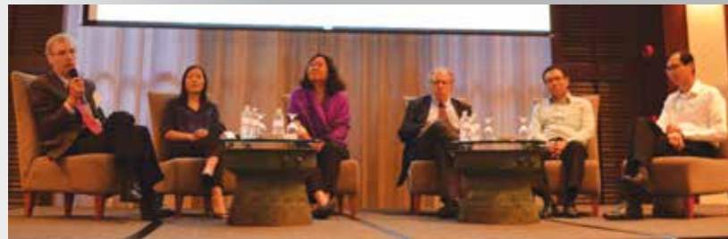
Participants at the BMSC eXchange 2013

The participants spent a knowledge-intensive afternoon learning about the challenges faced in the biomedical industry and the benefits of implementing biomedical standards. A wide range of hot topics in the industry were discussed, including cell therapy standards and the adoption and implementation of biomedical standards in companies.