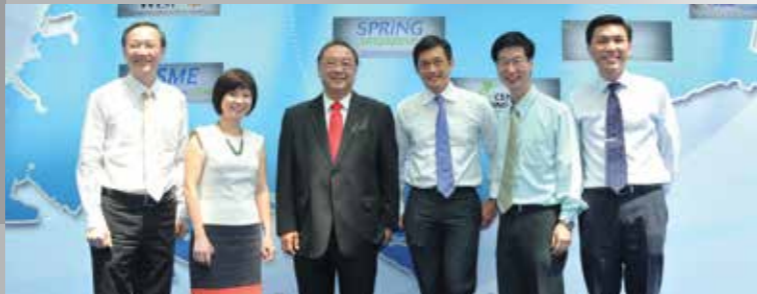
SME Centre@SMF saw the launch of its first satellite centre at South West CDC

10 July 2013 was a milestone date for SME Centre@SMF as it marked the launch of SME Centre@SouthWest, the first satellite centre of SME Centre@SMF. The launch was held at the Jurong Town Corporation Summit where the South West Community Development Council (CDC) was located. More than 70 guests attended the event, including representatives of government agencies, trade association chambers and SMEs.