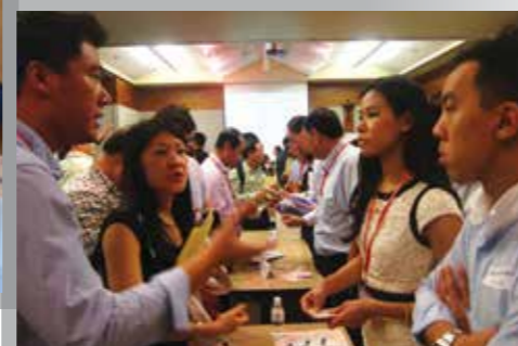
Participants exchanging name cards and business information at the business matching session