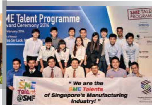
Excited young SME talents who were due to receive their awards at the STP Award Ceremony 2014