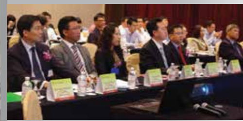
The China Petrochemical Industry Conference 2013