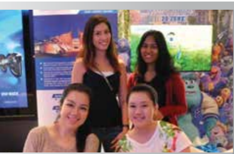
Student Ambassadors of SMF Institute

More than 70 students have registered to become ambassadors of SMF Institute. The ambassadors have contributed to the school in various ways, including writing as student bloggers to share their learning experience in SMF Institute. In addition, they are also involved in the making of the SMF Institute video marketing project, as well as helping in a series of activities and events, such as the Race the Dead Roadshow, Halloween celebrations and ActiveSG roadshows.