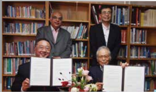
IATSS Forum aims to bring out the best qualities in individuals who will one day become the future leaders of Asia

The objectives of the Memorandum of Understanding (MoU) between SMF and IATSS are: to promote interest in the teaching and research forum activities of the respective organisations; to promote goodwill between IATSS Forum and SMF; to deepen understanding of the economic, cultural and social issues; and to promote youth leadership training through the annual IATSS Forum held in Japan by the IATSS Forum.