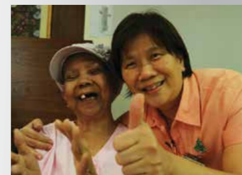
The MME IG demonstrated the true spirit of Christmas by visiting the residents at Dover Park Hospice

The objective of 'SMF Cares' is to cultivate the spirit of volunteerism. The initiative established partnership between SMF and two charity and welfare organisations – Club Rainbow (Singapore) and Lions Befrienders Service Association (Singapore). SMF members are encouraged to actively volunteer at these organizations. The members have organised monthly birthday celebrations at Lions Befrienders and held story-telling and art-and-craft sessions for the children at the KK Hospital through Club Rainbow.