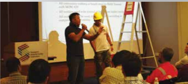
Speaker at the FPP Workshop demonstrating workplace safety measures to the audience

The workshop aimed to educate participants on the salient points of the Work at Heights Regulation. Through the demonstration, participants also learnt how to develop and implement the FPP.