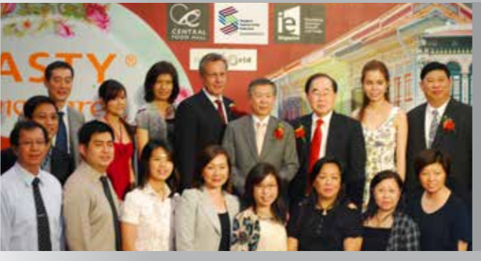
WIP Programme is a great platform for food companies to expand and grow their businesses

Local food companies have since successfully embarked on WIP initiatives in Thailand and Myanmar.