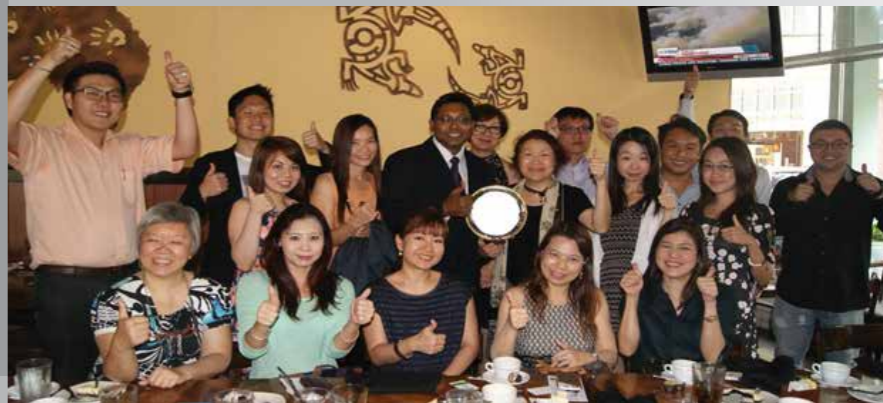
A good lunch and a good course on dining etiquette

On 28 February 2014, SMF Lifestyle Industry Group organised a Business Dining Etiquette class to coach participants on the appropriate dining etiquette during a business dinner. The class attracted many business leaders from different organisations to learn about the Dos and Don'ts of proper business dining etiquette. In addition, participants also learnt business conversational skills during the interactive course. The trainer demonstrated techniques of fine dining as well as how to deal with potentially embarrassing moments on the dining table.