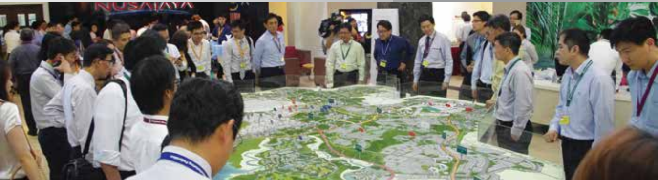
Business missions and visits to foreign countries are a great platform for local enterprises to network with the companies there