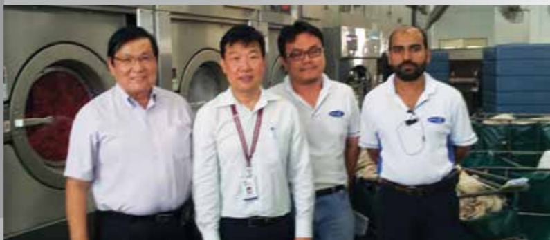
Over 40 cleaning companies have participated in SME QIANG to increase their productivity

SME QIANG (Quality Initiatives to Assist, Nurture and Grow) is a jointly developed training programme by SMF and Singapore Workforce Development Agency (WDA). SMF Centre for Corporate Learning (CCL) collaborated with the National Environment Agency to contextualise SME QIANG programme for the cleaning and environmental services industry. Over 40 cleaning companies have participated in SME QIANG to increase their productivity. After the programme, majority of the companies have observed significant improvements to their work processes. They have also implemented the same techniques in other areas as well.