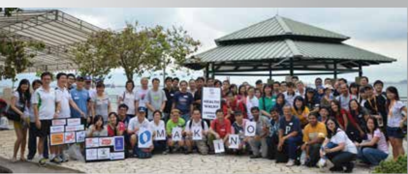
Group photo of the participants at the end of the walk

Keeping fit can at times be, quite literally, a walk in the park. To promote healthy living and staff bonding amongst SMF members, the SMF Health, Safety, Security and Environment Function Committee organised the Health Walk @ Labrador Park on 7 September 2013. Eighty-five participants took a breezy mangrove board-walk in the morning, enjoying the lush scenery while interacting with their colleagues. The 2 km walk came to a satisfying end at a seaside pavilion, with the participants feeling well-energised and rejuvenated. Many of them agreed that the walk was both a good workout and a pleasant bonding experience with their colleagues.