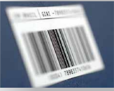
GS1 Singapore is the only organisation in Singapore to develop and launch the CVA Service in the certification industry

The CVA Service received welcoming response from the high-value certificate issuers of public and private institutions, training organisations, as well as recruitment and hiring companies in the JCEF. With the CVA Service, it increases the credibility of the certificates given out by organisations, ensuring that any due recognition is authentic and legitimate.