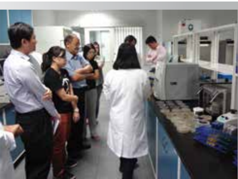
Visitors learning product testing practices at SETSCO

On 7 November 2013, SMF organised an industry visit to SETSCO Services Pte Ltd for an educational visit to learn more about the product testing practices at SETSCO, one of Singapore's largest testing and inspection companies. During the visit, participants witnessed a demonstration of products and materials testing over a guided tour of the factory's established laboratories. The industry visit was an illuminating experience for participants to understand how testing and product compliance achieved quality and raised productivity. Participants also had the opportunity to explore how they could utilize SETSCO's accreditation scheme for business ventures.