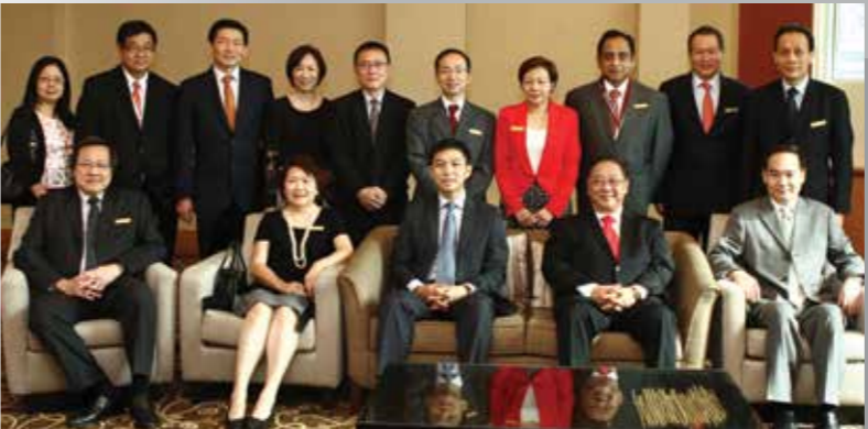
Group photo of SMF council members and secretariat at the Singapore Innovation and Productivity Conference 2013

Supported by SPRING Singapore and Singapore Workforce Development Agency, the conference attracted a crowd of more than 400 participants from the manufacturing sector and business community at large. Five local and international expert speakers were invited to share their insights on the various aspects of BMI from different perspectives of academia, consultancy, research and industry. A panel discussion was also held with the focus on contextualised BMI within the Singapore landscape.