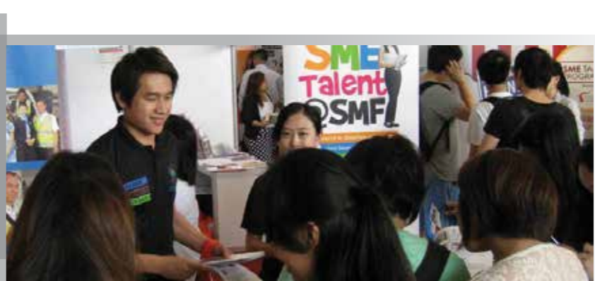
The STP team at career fairs to attract new talents

Supported by SME Centre@SMF, Centre for Corporate Learning (SMF CCL), Singapore Innovation and Productivity Institute (SiPi) and SMF Institute of Higher Learning (SMF Institute), the SMF Global Talent Development Programme Practicum allowed both local and international students to gain exposure to the working world through attachments with Professional Business Advisors at SMF. They will be able to observe closely how enterprises operate. The Practicum also consists of business development visits to companies, attending seminars, workshops and conferences organized by SMF.