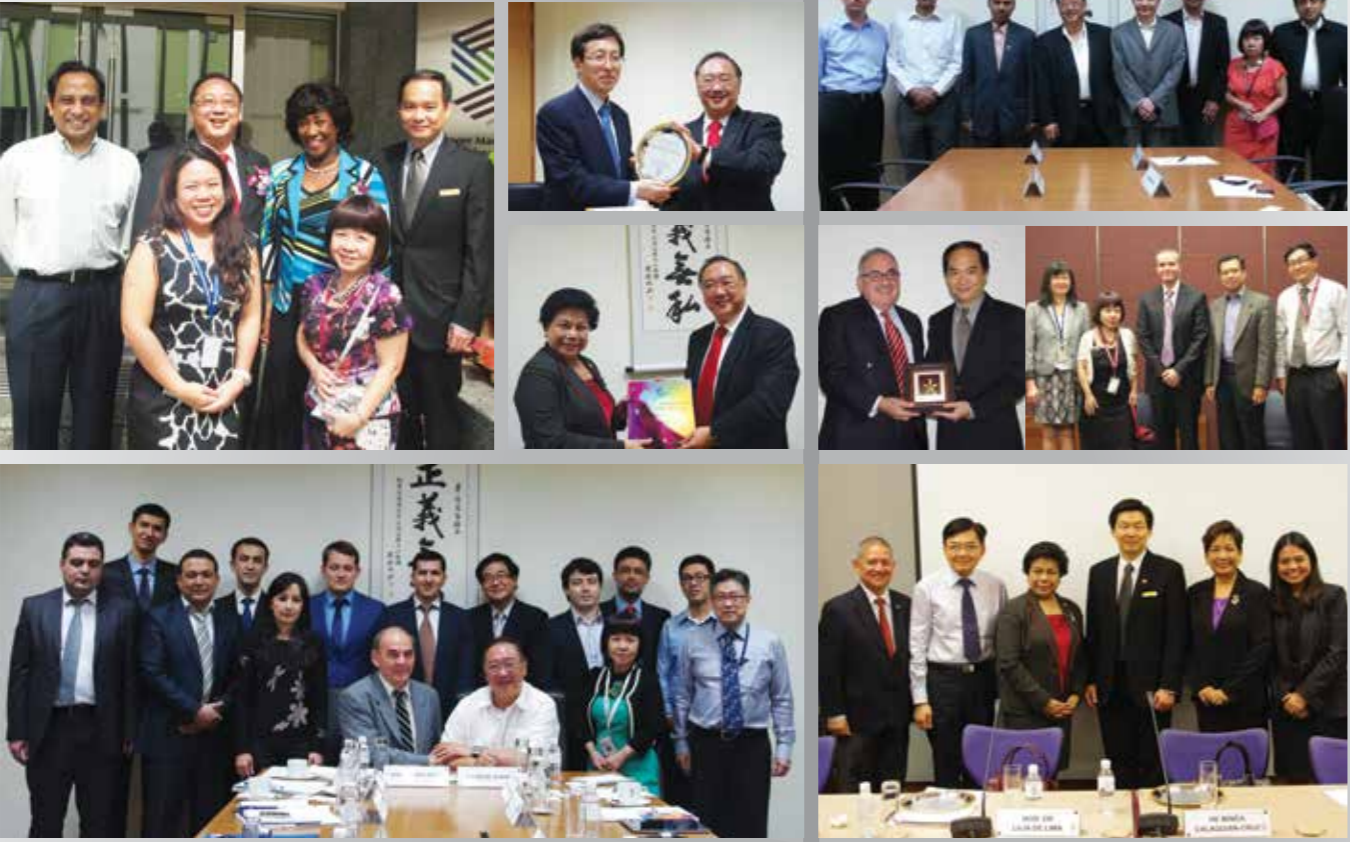
SMF played host to many different groups of guests from countries including the United States of America, Mexico, China, South Korea, Australia, Ethiopia, Russia, the United Kingdom, the Middle East region, and many more.

In addition, SMF is also honoured to have received VIP guests, such as esteemed dignitaries, ambassadors and high commissioners, to the organisation. Through meetings and discussions, SMF is able to exchange industry knowledge with these notable individuals and explore ways for a mutually beneficial collaboration.