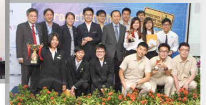
The top five teams of the inaugural SiPi Challenge Trophy 2014