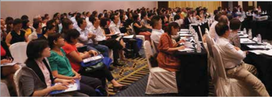
The launch of SS590 would see the improvement of food safety

The new SS590:2013 Singapore Standard for Hazard Analysis and Critical Control Points based Food Safety Management System was organised by SMF Standards Development Organisation (SMF-SDO) on 10 January 2014. This new standard would enhance the credibility and competitiveness of the food manufacturing companies in terms of food safety. Its implementation would improve the food safety and productivity of the businesses, hence increasing the chances for international export.