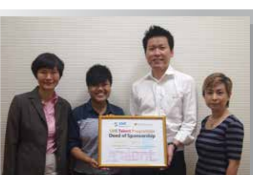
The STP aims to help supply the industry with fresh talents

SME Centre@SMF, on behalf of SMF, has been appointed to administer the STP to benefit SMEs for the industry, with a focus on the manufacturing and engineering clusters. The STP team has since established its presence in numerous outreach channels across learning institutes and military campuses to build up a robust pool of suitable student candidates. By March 2014, the STP team has approved 28 SMEs for the programme, with 16 students successfully matched to 11 companies from a database of 250 students.