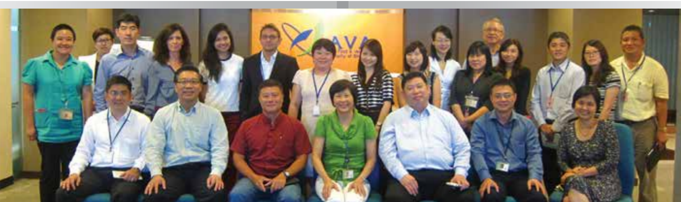
Pleased participants after the successful dialogue session

Issues were debated, questions were raised and answered, and insights were shared without restraint. It was a fruitful session that addressed the food manufacturers’ concerns.