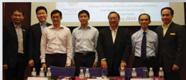
SMF was honored to receive both Ministers to the dialogue

The dialogue was an eye-opening and invaluable experience for the participants who were prepared to respond to the challenges and ride on the wave of transformation alongside the nation.