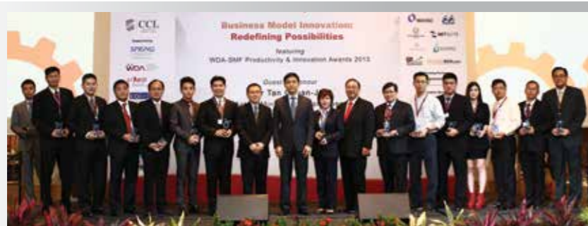
Some of the recipients of the WDA-SMF Productivity & Innovation Awards 2013

A total of 20 companies were honoured with the awards for their efforts at raising productivity. The awards represent the industry's acknowledgement of companies that have completed their first productivity improvement training through either the Singapore Workforce Skills Qualification (WSQ) Certified Productivity & Innovation Manager, or the SME Quality Initiatives to Assist, Nurture and Grow training courses.