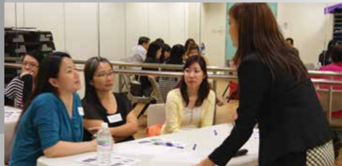
Participants at one of the workshops under the Workplace Wellness Programme

While workplace safety cannot be taken for granted, organisations should also be responsible for employees' workplace health, which is an area that is equally important but can sometimes be neglected. SMF and the Health Promotion Board (HPB) embarked on a pilot programme to provide a holistic approach to workplace wellbeing. With funding provided to run from June 2013 to April 2014, the Workplace Wellness Programme has received positive feedback from the participating companies, which were able to tap on a broader range of services from the health consultancy companies appointed by HPB and SMF.