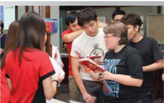
The company exhibition attracted both graduating students and professionals

Highlights of the CET Fair included the company exhibition, where a total of 17 companies set up their booths and provided a great opportunity for students and job seekers to explore their career options. In addition, there was also a series of talks on Productivity Solutions, Career Prospects in Logistics and Supply Chain Industry, as well as on the SME Talent Programme.