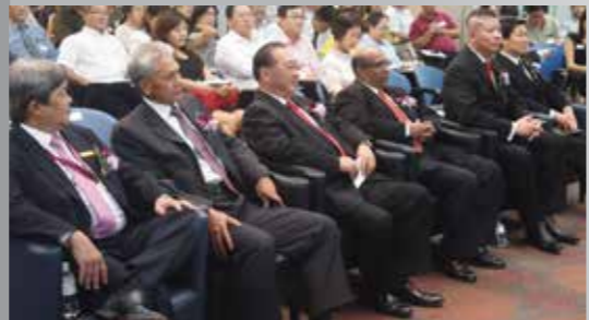
The seminars and conferences cover a wide spectrum of topics that would help the companies in their overseas ventures

With the goal of creating global networks, GBG is on a constant look out for potential business growth and opportunities. Trade missions are organised to overseas countries as a means for interested parties to discover and explore possibilities of cross-country collaborations. The business missions by GBG are an important gateway for local companies to venture abroad. For instance, with the economic growth of Iskandar, Malaysia, several business missions were conducted to the region to seek new investment and business opportunities. More than 380 participants across industries have joined GBG on these trips. Other key business missions included visits to Myanmar, mainland China and Taiwan.