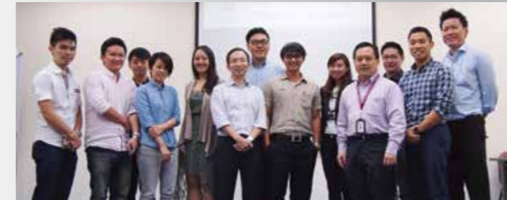
The Youth Network Function Committee team aims to discover and develop the potential of future leaders of the industry

Young leaders are able to ride on this platform to further develop their leadership skills and widen their network. Members of the SMFy are also encouraged to participate in an array of SMF organised events to gain a better understanding of the work at SMF. Through SMFy, would-be leaders are able to connect to the community and contribute to the industry and society.